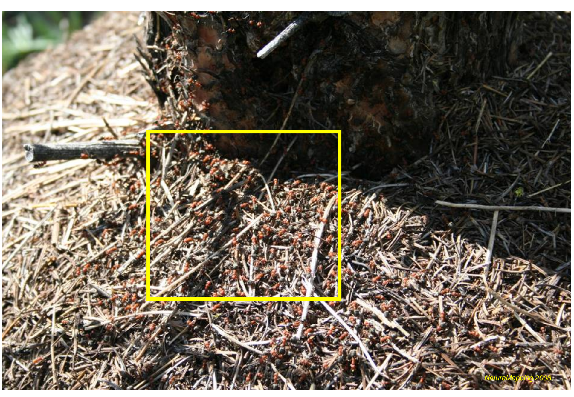
6" by 6" section