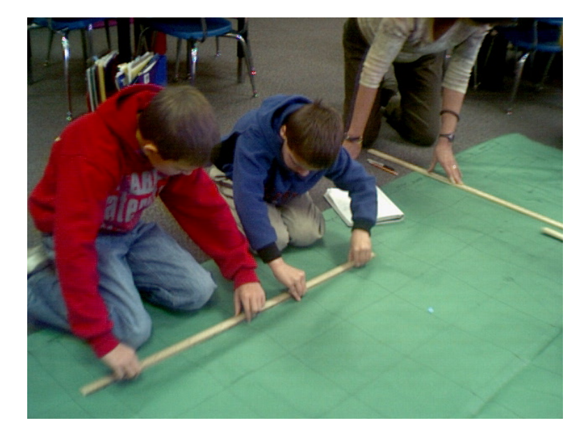
Students are using 20 second grid lines for locating their exact Latitude and longitude