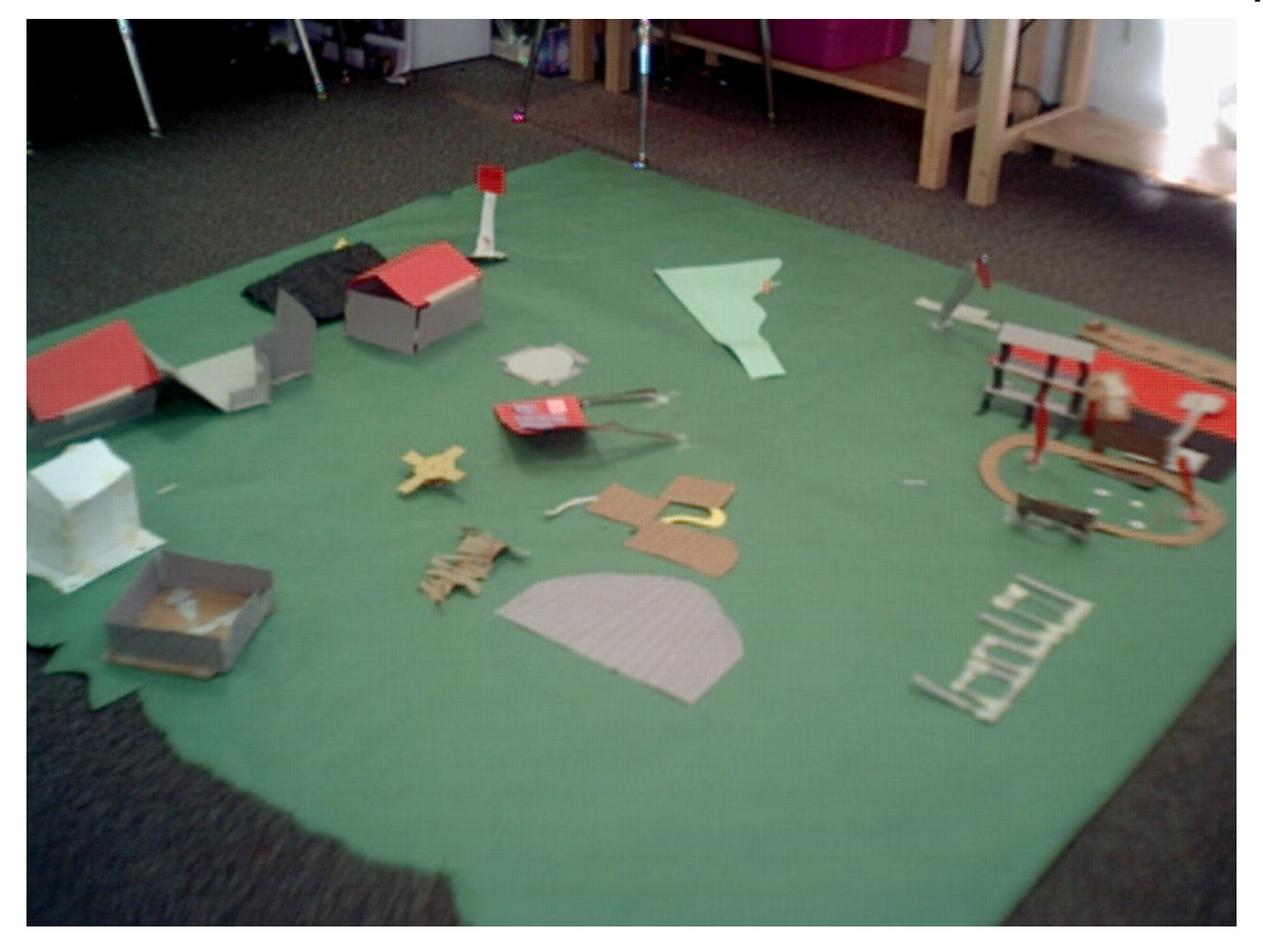
Students "built" their schoolyard and tried to place the buildings, flag poles, football field, in the proper position after walking around the grounds.