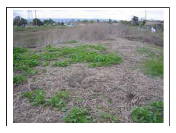
A site where mustard was removed